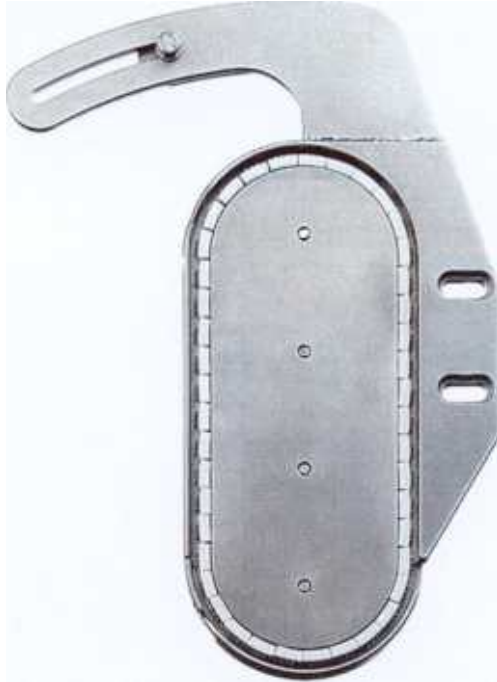
Chain temple for bolting cloth