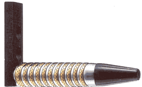
Additional temple for fabrics with considerable weaving-in